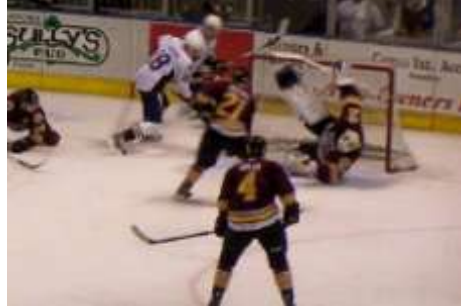
03/06/09 - CHICAGO WOLVES