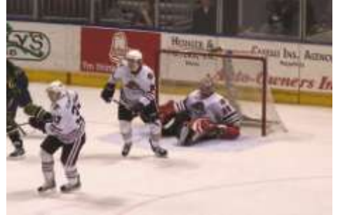
03/07/09 - ROCKFORD ICEHOGS

SPECIAL VISITORS