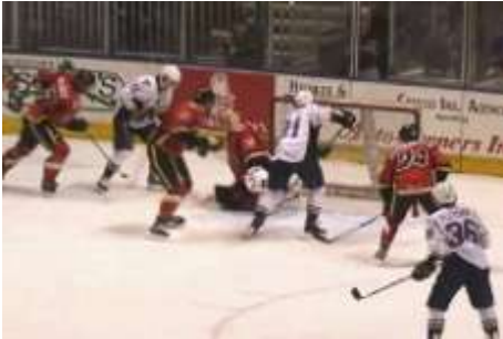
03/04/09 - QUAD CITY FLAMES

THREE TEAMS - THREE GOALIES - ONE WEEK THE MOVES THE RIVERMEN PUT THEM THROUGH