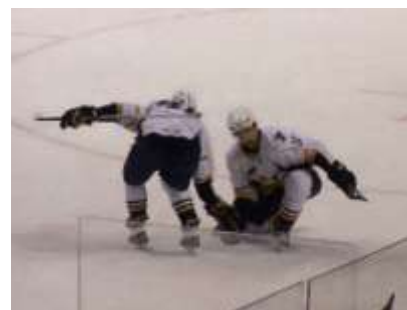
HIGH FIVE DOWN LOW