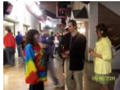
03/06/09 - RIVERMEN HALL OF FAME INDUCTION